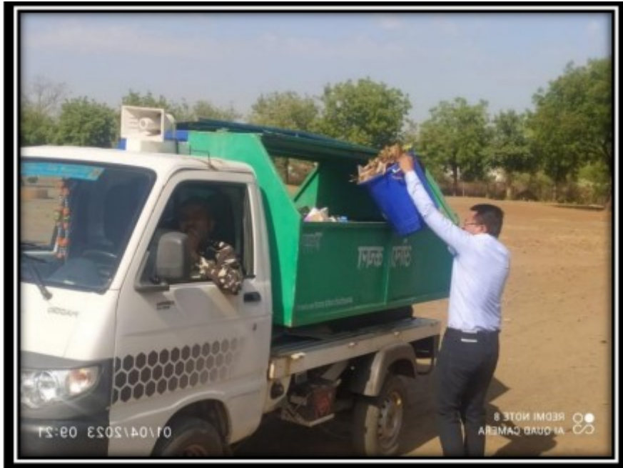
Solid Waste Degradable Collection by Nagarparishad Chandur Railway